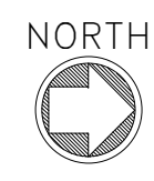
MAIN ROOF FRAMING PLAN SCALE 3/16" = 1'-0"